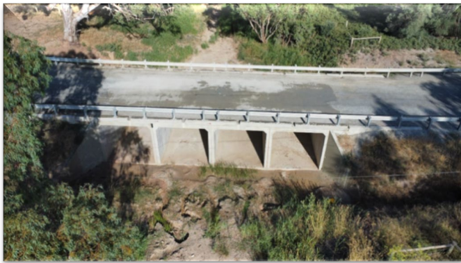
Award winning Gerald Roberts Road bridge constructed in 2021